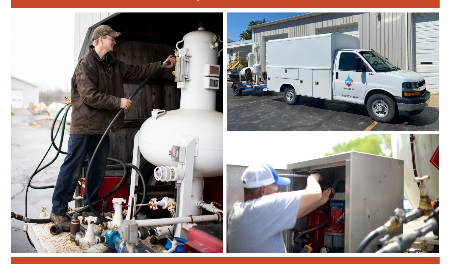
Propane Autogas design, installation, and service featuring Gilbarco Encore dispensers as well as Gasboy Atlas dispensers