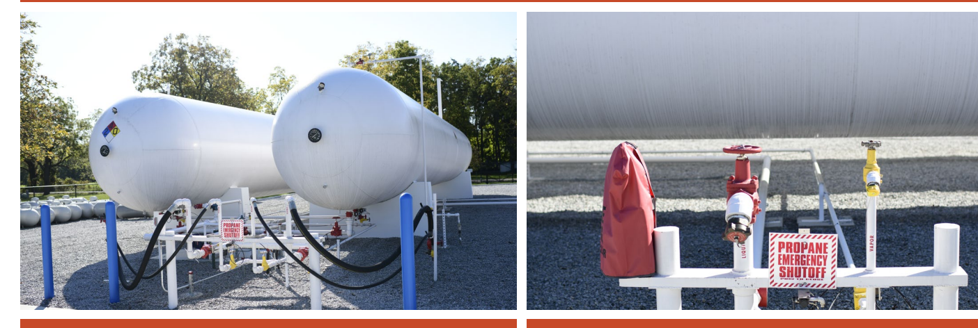
Welded & threaded piping options