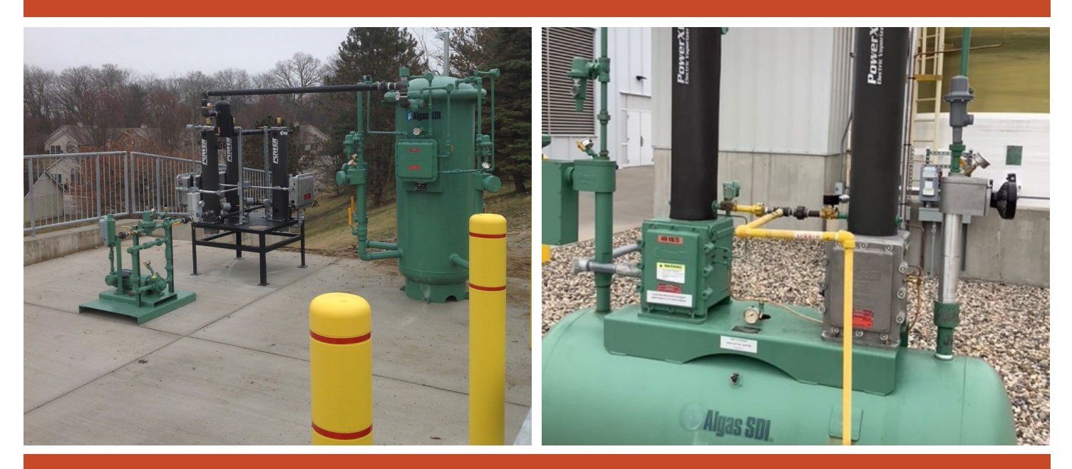
Inspections, training, and maintenance of bulk plants

Propane standby systems for facilities such as hospitals, correctional facilities, and manufacturing facilities