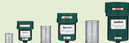
Lumin LPG Filters