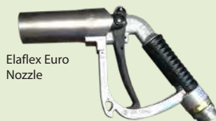
Elaflex Euro Nozzle