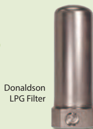
Donaldson LPG Filter